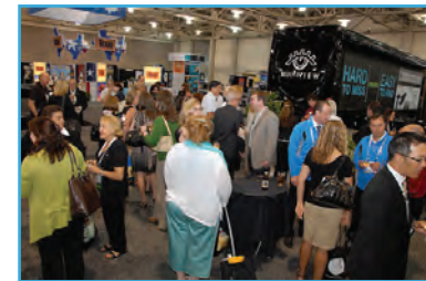
After-hours cocktail reception