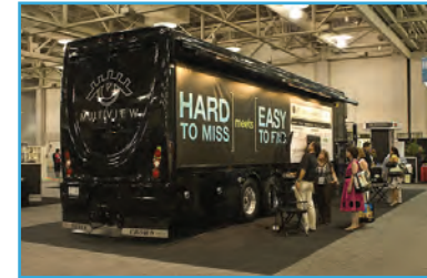
Guide demo at MPI 2009 World Education Conference