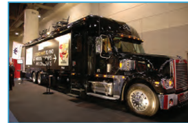
At 2009 ASAE Expo in Toronto